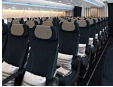
A330neo Economy Class