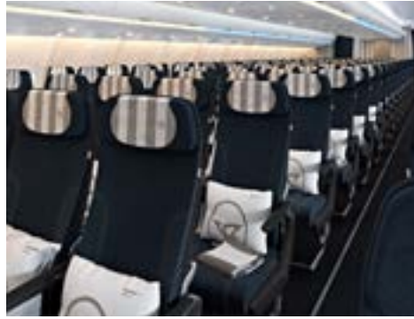
A330neo Premium Economy Class