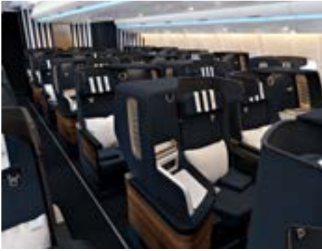
A330neo Business Class