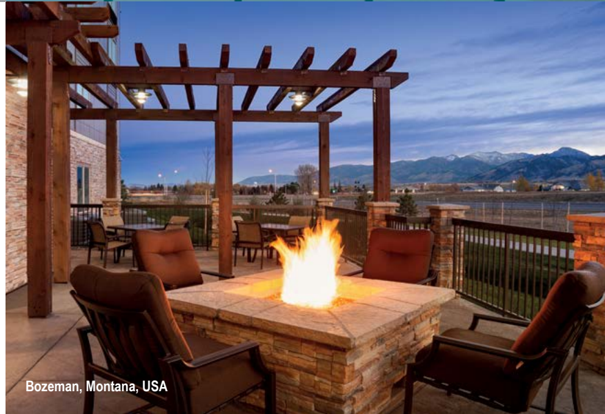
Bozeman, Montana, USA