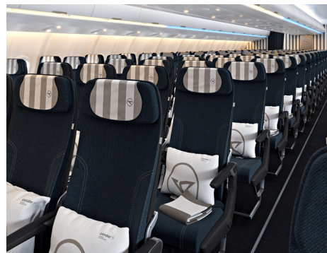
A330neo Premium Economy Class