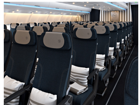
A330neo Economy Class